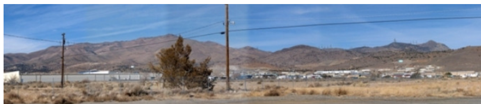
Proposed View from Hwy 341 and Hwy 50