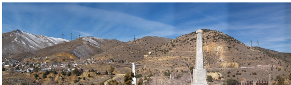
Proposed View from Firemans' Cemetery

Comstock is the region's largest symbol for Northern Nevada's commitment to green, sustainable energy. The New Comstock will provide valuable tax revenue for Storey County, Washoe County and Carson City as well as approximately 15 long-term jobs.