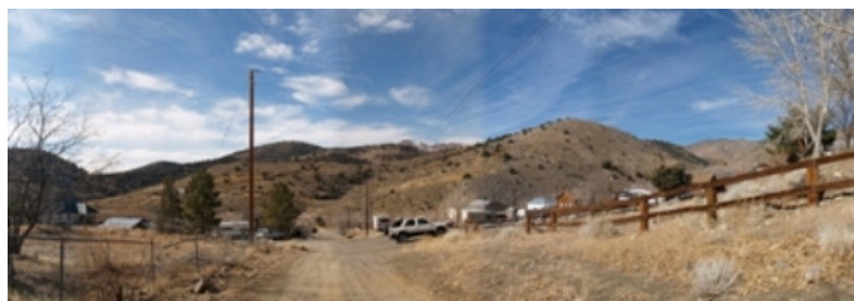
Proposed View from Silver City

The visual simulations presented here are for informational purposes only and are based on the New Comstock Wind Energy project layout as currently proposed. The proposed layout is subject to all required local, state, and federal review, permits, and approvals, including the Environmental Impact Study (EIS) to be performed by the Bureau of Land Management (BLM), and is therefore, subject to change. These visual simulations were produced by Great Basin Wind LLC and have not been approved by the BLM. The BLM will produce separate visual simulations during the EIS process for the New Comstock Wind Energy Project